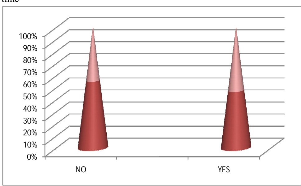
Figure 3: Students' opinion about English module schedule.

This question relates to the amount of time devoted for studying English. The figure below illustrates the outcomes of the students' replies to the English module time table.